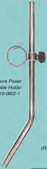
Shore Power Cable Holder F16-0802-1